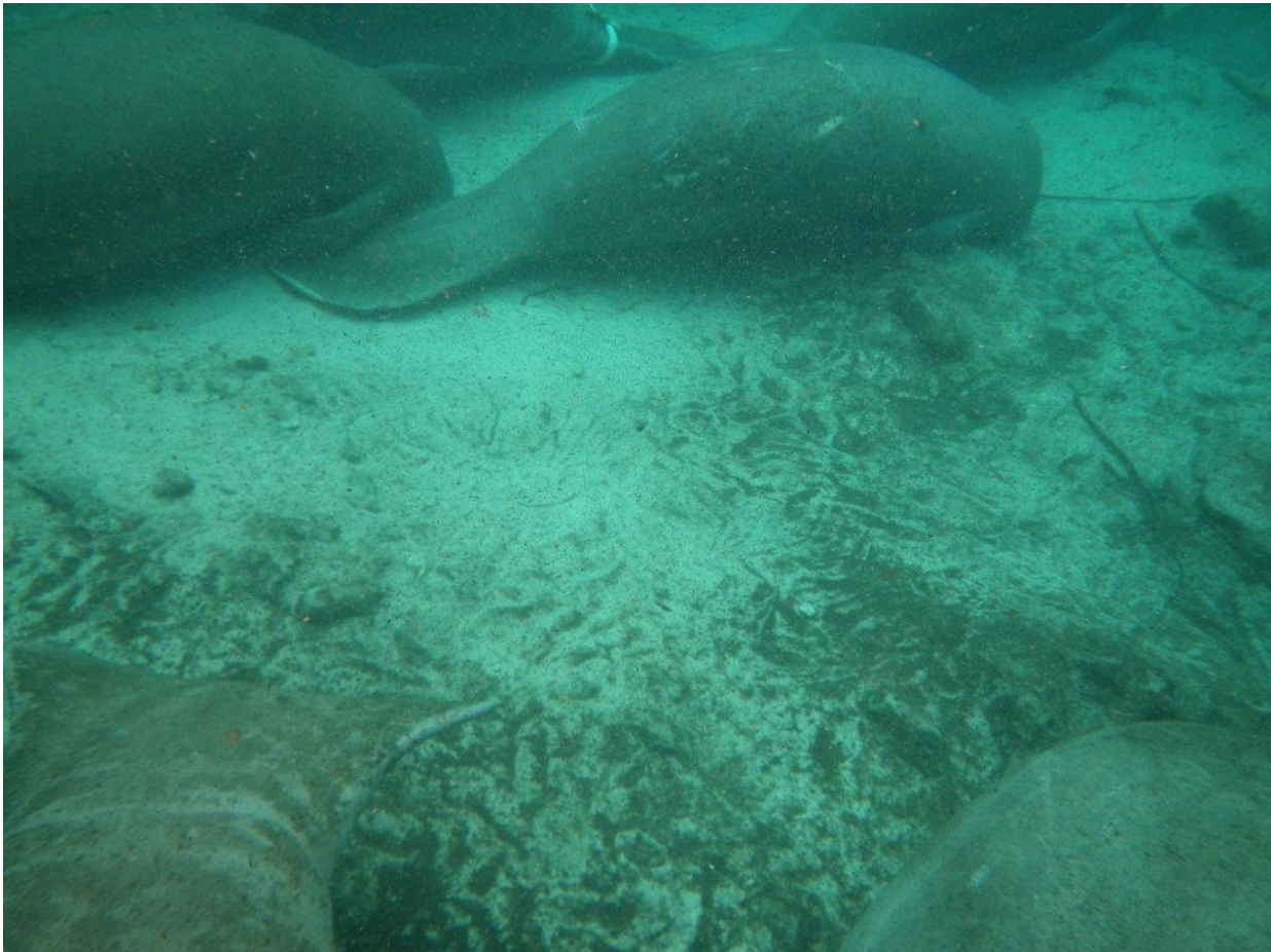
Adult Manatee and babies