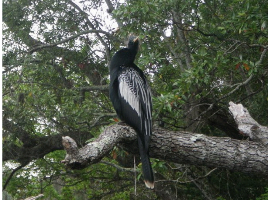
Anhinga Weeki Wackee River, Fla.